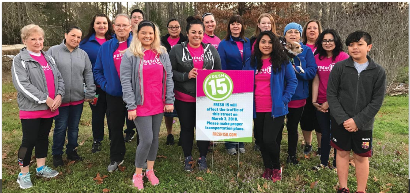
Bethesda Staff and Volunteers