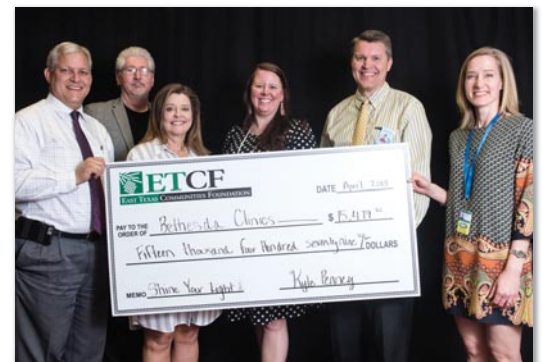
Shine Your Light Check Presentation

We would like to thank the Tyler Morning Telegraph, anchor donors and members of the community who donated to the Shine Your Light Campaign at the end of the year. Because of this generous community response, Bethesda is grateful to have received: