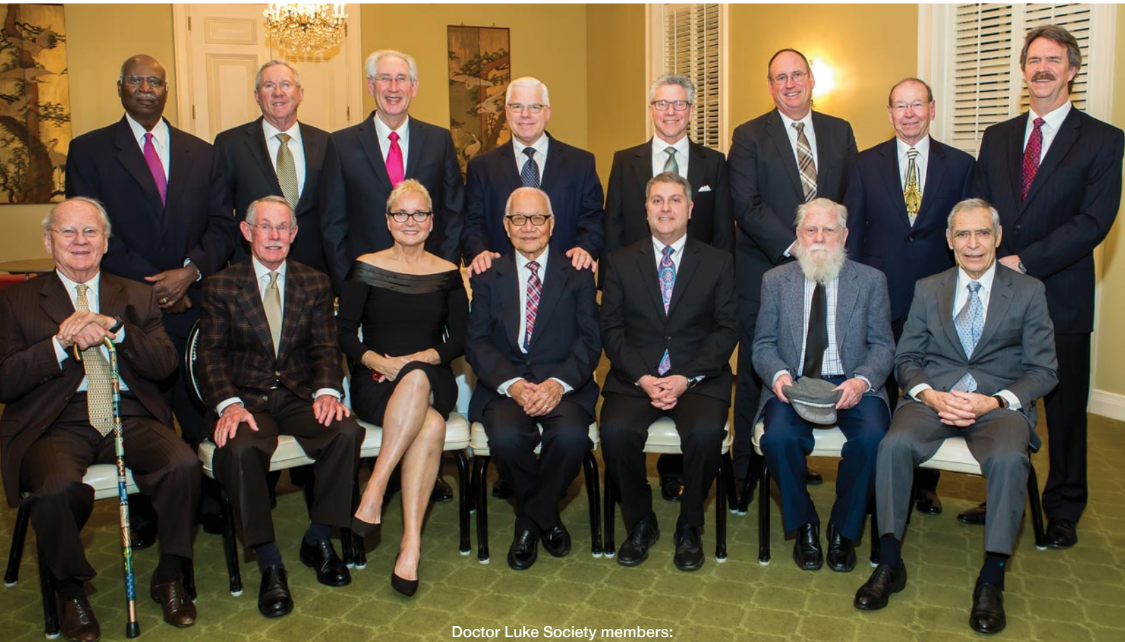
Doctor Luke Society members: