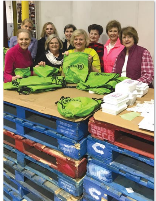
Bethesda Alliance volunteers for FRESH15

Registration for the 2019 FRESH 15 is already open and filling up fast! Bethesda encourages supporters to sign up to run or volunteer at www.bgcracing.com .