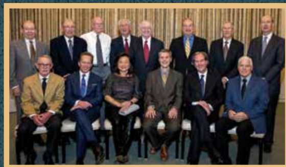
Doctor Luke past honorees photographed with the new inductees at the event.

Inspired by the reference in Colossians 4:14, in which the Apostle Paul refers to Saint Luke as "the beloved physician," the Doctor Luke Society is a unique opportunity to express esteem and appreciation to these exceptional medical professionals.